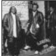
Living The Lyrics