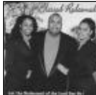
Let the Redeemed of the Lord Say So!