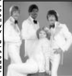
NOW & THEN

And he saw this video called Midnight Blues and he flipped out. He asked his people to go buy my CD and wanted to find out where this guy's from