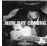
New Day Coming